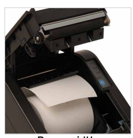
Paper width: 50mm ~ 82.5mm